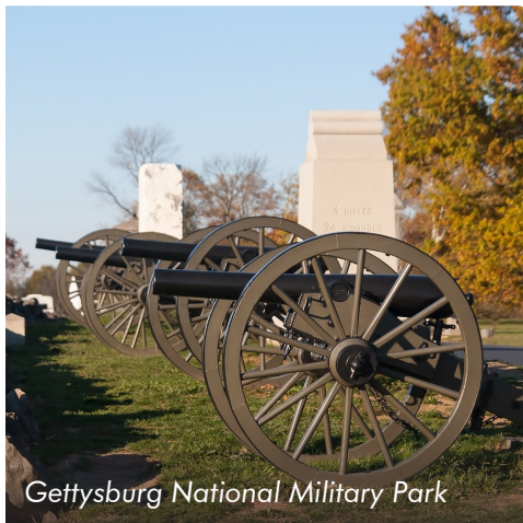
Gettysburg National Military Park