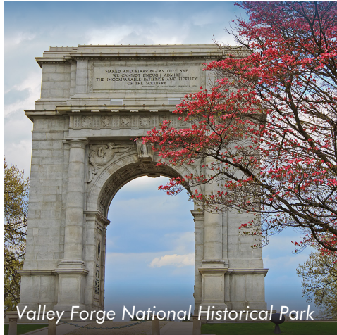
Valley Forge National Historical Park